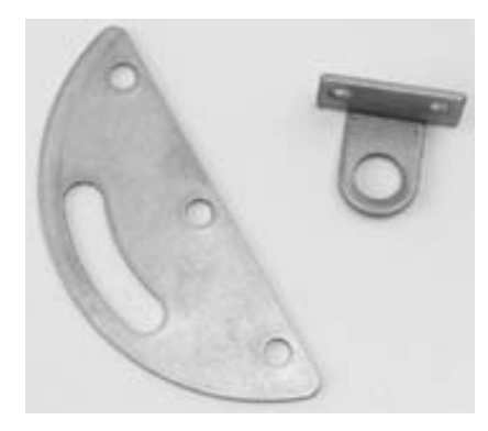
The recommended padlock is the PC-000205M sold separately.

The LK04 -1000 Door Lock Kit - is designed to be used with most portable restrooms. This kit can be mounted anywhere along the non-hinged side of the door and door jamb. The hasps are made from stainless steel and the rivets are aluminum, assuring a no rust maintenance free long life. Fasteners supplied with kit are designed to be used with doors made with steel pillars and jambs of aluminum. Alternative fasteners may be necessary if used with doors and jambs made of other construction.